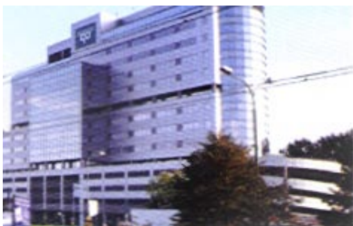
The modern building of ‘The Silesian Bank’.

The Upper Silesia region was called ‘a jewel in the crown ’ in one of the films made by Kazimierz Kutz, an outstanding Polish director. For centuries, this important and attractive region has been heavily urbanized and the most industrialized part of Poland due to natural conditions favourable for coal mining and metallurgy. Katowice, the capital of Upper Silesia, with a population of 323,200, is now one of the greatest economic, scientific, cultural, political and administrative centre in Poland. Katowice has become a place of substantial investment: transport routes, many banks, hotels, office buildings, the culture and science centres have been built here in recent times.