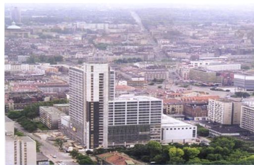
The view of the city with ‘Altus’ office building.