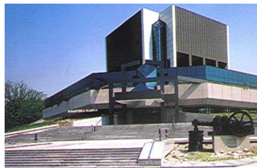
The Silesian Library in Katowice.