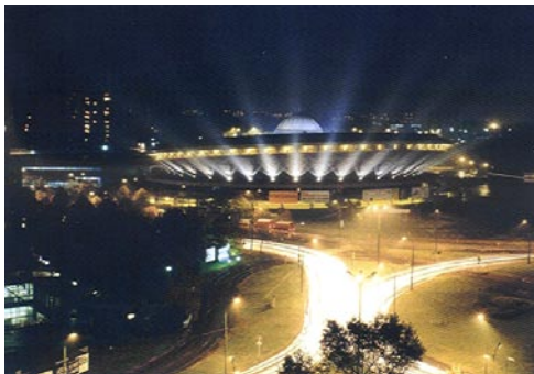
Spodek (the ‘Saucapan’).

Katowice is a well-developed centre of science and culture with many private and state owned higher education schools. The Silesian University, the Academy of Economics, the University of Technology, the Music Academy, the Medical Academy are examples of them. There are also numerous research institutes of the Polish Academy of Sciences. All year long in cultural centres such as the Upper-Silesian Centre of Culture, the Silesian Philharmonic, the Silesian Theatre, Spodek (the ‘Saucapan’) and art galleries there take place national and international cultural events. There are many seasonal events in the summertime, which take place in Kościuszko Park or performances in the Summer Theatre in the Silesian Centre of Culture.