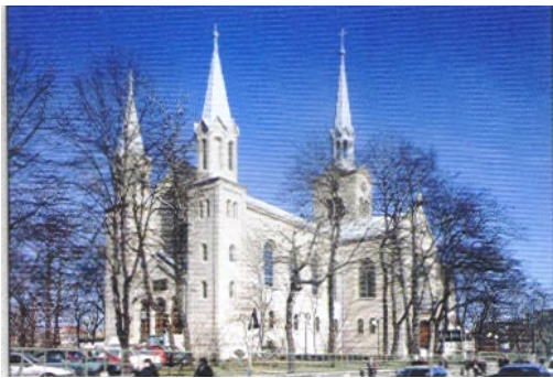
The Neo-Romanesque Evangelical Church built in 1858.

Katowice evolved from a rural settlement into a mining and metallurgical industry centre in the early 19 th century. The dynamic growth of Katowice, which was granted municipal rights in 1865, is reflected in the richly varied architecture. The buildings which have survived until today represent a variety of styles, from the early 16 th century wooden Church of St. Michael Archangel, through the examples of Neo-Gothic, Neo-Romanesque, eclecticism, Art Nouveau, functionalism and constructivism of the inter-war period, to the modern architecture of the latest days. A visit to the Museum of History of Katowice provides an interesting insight into the history of the region, its people, customs and traditions.