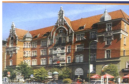
The Silesian Museum.

Katowice is a well-developed centre of science and culture with many private and state owned higher education schools. The Silesian University, the Academy of Economics, the University of Technology, the Music Academy, the Medical Academy are examples of them. There are also numerous research institutes of the Polish Academy of Sciences. All year long in cultural centres such as the Upper-Silesian Centre of Culture, the Silesian Philharmonic, the Silesian Theatre, Spodek (the ‘Saucapan’) and art galleries there take place national and international cultural events. There are many seasonal events in the summertime, which take place in Kościuszko Park or performances in the Summer Theatre in the Silesian Centre of Culture.